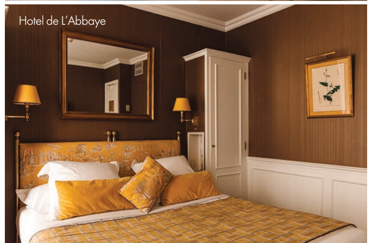
Hotel de l'Abbaye