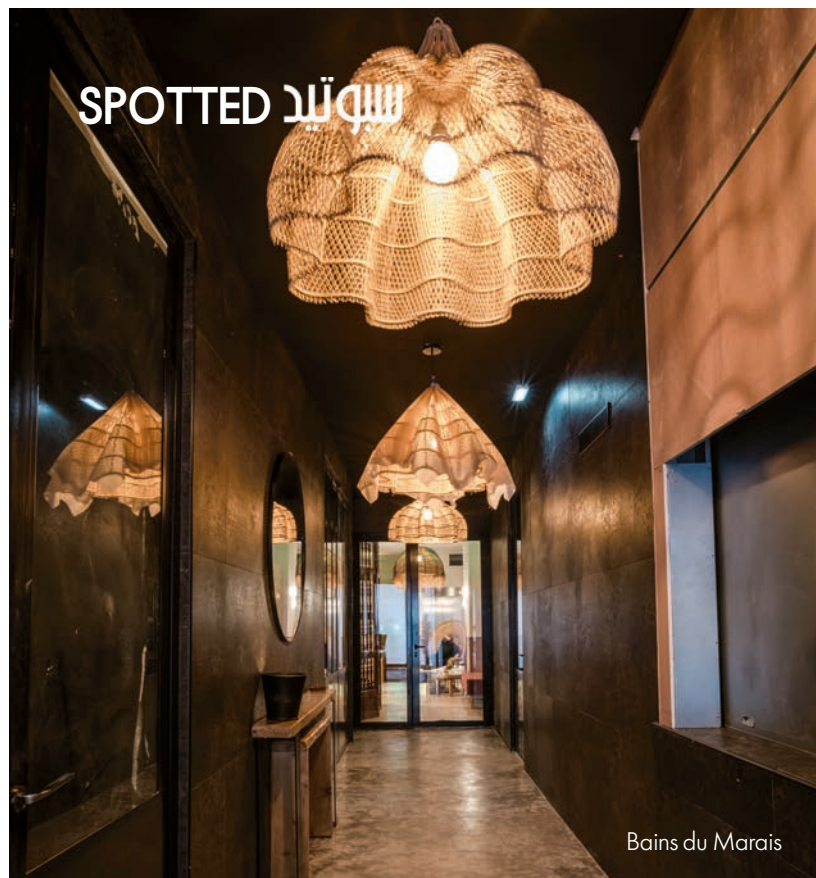
Bains du Marais