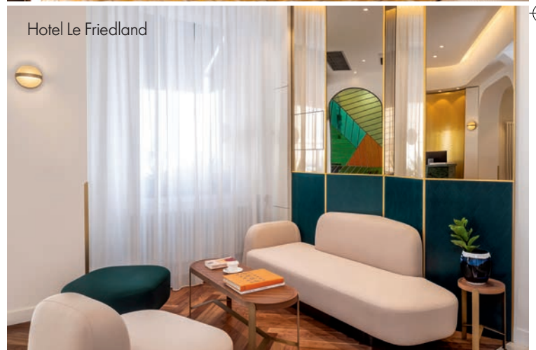
Hotel Le Friedland

perfume house, Diptyque. Enjoy Parisian luxury and romance and discover the best kept 6th arrondissement secret. Hush!