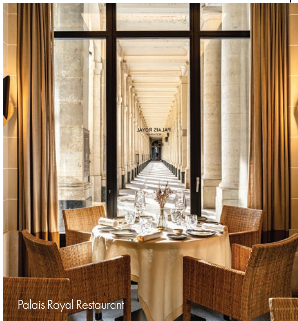
Palais Royal Restaurant